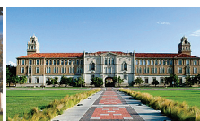
Texas Tech University