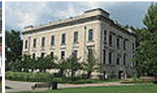
Indiana State University