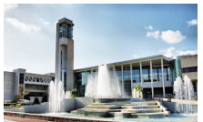
Missouri State University