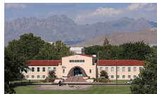
New Mexico State University