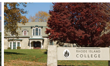
Rhode Island College