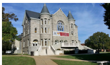
Virginia Union University